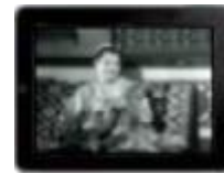
TABLET App store Apple / Samsung