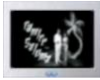
TV channel Free to air / Subscription