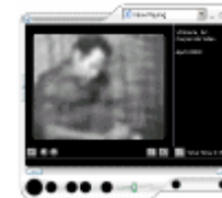
TOURISM KIOSK P. Ramlee Memorial (KL) / P. Ramlee Gallery (Penang)